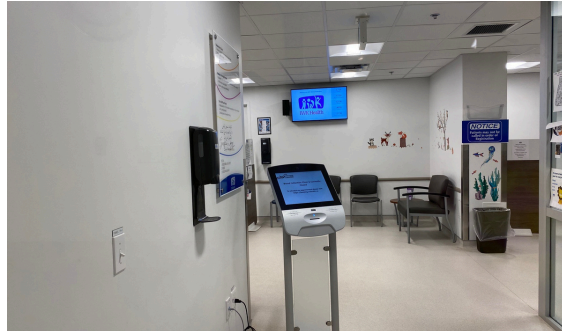
CHECK IN AT KIOSK AND TAKE A SEAT The registration clerk will call you up to the desk using the number you received at the kiosk.