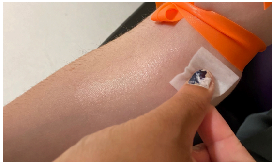
THE MLA CLEANS YOUR ARM They use a small square wipe which may be cool and smell a bit.