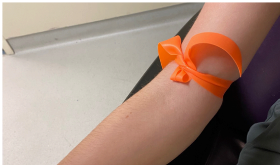
THE TOURNIQUET TIES AND SQUEEZES YOUR ARM. They may also ask you to make a fist or squeeze a toy with your hand.