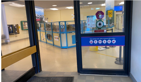
ARRIVE AT THE HOSPITAL 1st Floor by South Street Entrance