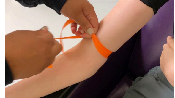
ONCE IN THE BLOOD COLLECTION ROOM, THE MLA WILL LOOK AT THE VIENS IN YOUR ARMS. They use a tourniquet (a stretchy band) to help them see your veins.