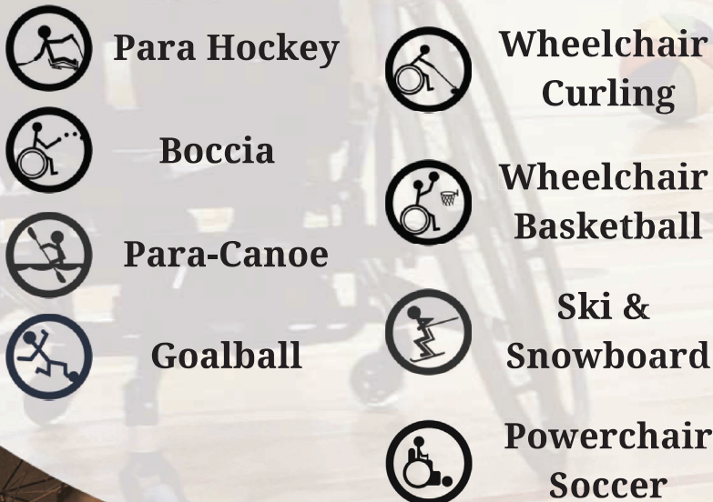
Map of Programs in Nova Scotia